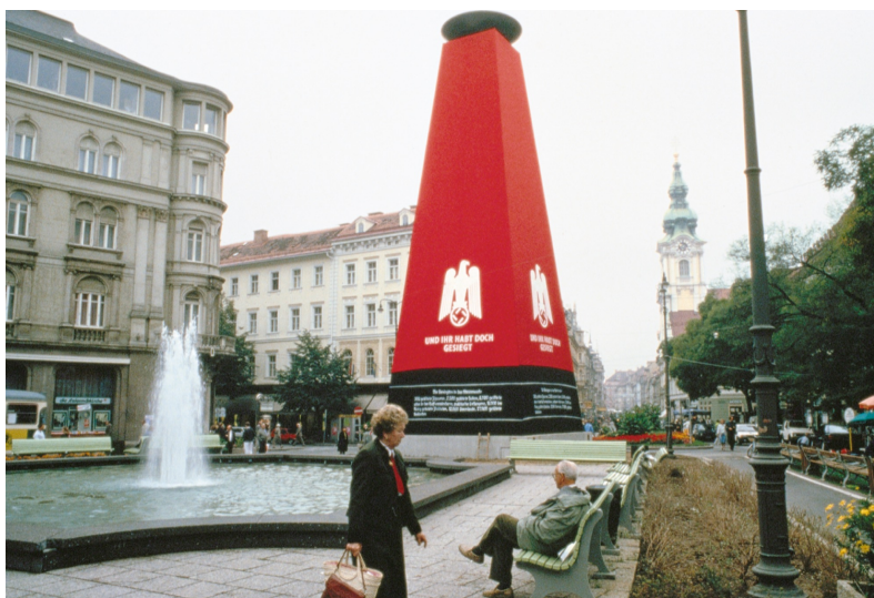
Hans Haacke, Und Ihr habt doch gesiegt And You Were Victorious After All, installed in Graz, Austria, 1988. Generali Foundation Collection.