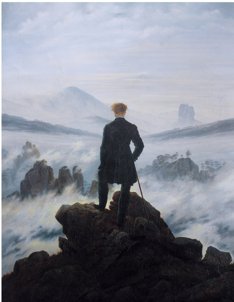
Caspar David Friedrich, Wanderer above the Sea of Fog , 1818, 94.8 cm × 74.8 cm. Hamburger Kunsthalle.