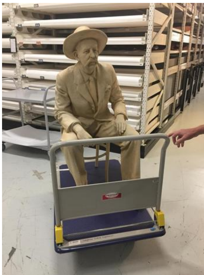
Baldwin Spencer model