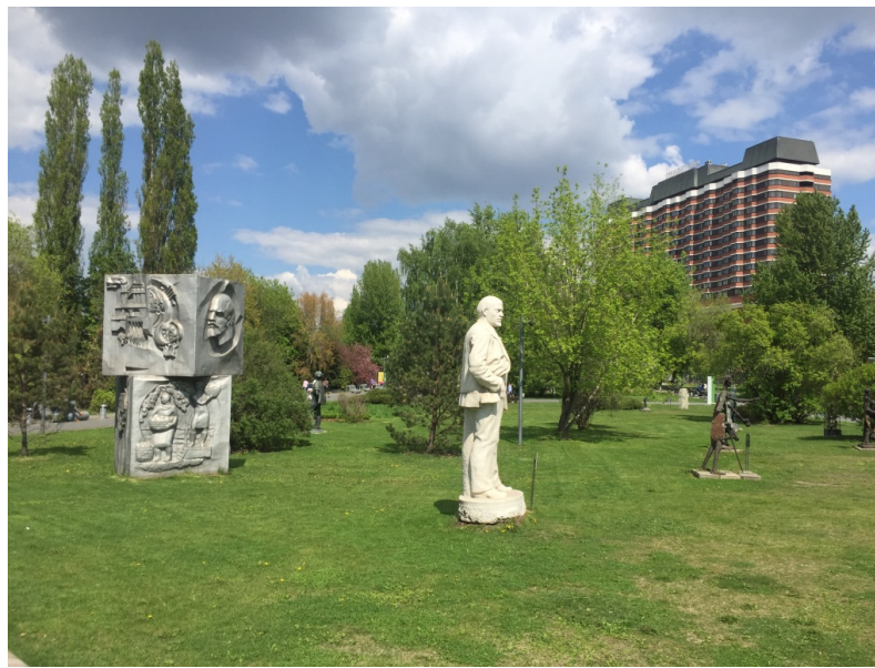
Fallen Monument Park, Moscow