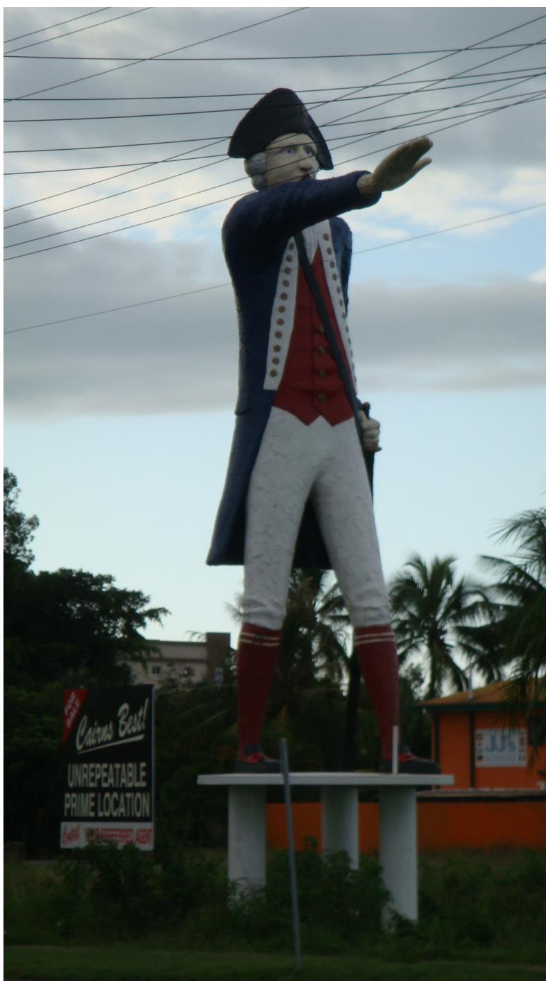
Cairns Captain Cook

The police protection of Woolner's statue guards more than an icon of colonial heritage; it also reasserts the sovereignty Cook claimed for the British Crown over the east coast of Australia in accordance with the doctrine of discovery and the theory of terra nullius , including all that it excluded from the colonial gaze. Woolner's statue is tethered to the dreams of a White nation, which established the Australian settler-nation-state today. 8 This symbolic value is the