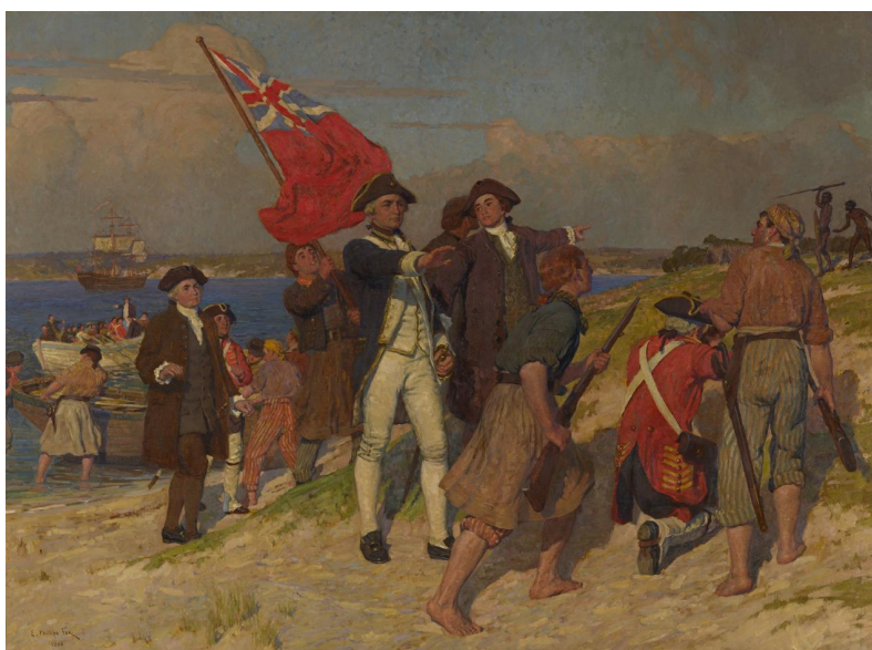
E. Phillip Fox, Landing of Captain Cook at Botany Bay , 1902, oil on canvas, 192.2 × 265.4 cm, oil on canvas, Melbourne Gilbee Bequest, © National Gallery of Victoria