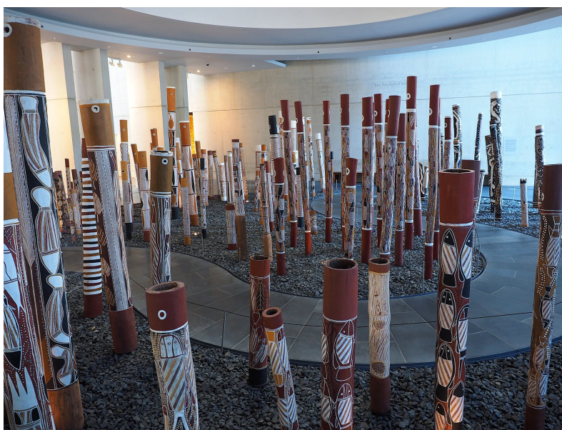
Ramingining artists and Djon Mundine (Bandjalung people), Aboriginal Memorial , 1987–88, natural earth pigments and binder on eucalyptus wood. Acquired by the National Gallery of Australia 1987 © National Gallery Australia.

Conceived by Bundjalung artist and curator Djon Mundine, the Aboriginal Memorial was a collaborative project involving forty-three mainly Yolngu artists associated with the art centre at Ramingining in the Northern Territory. 47 The Biennale coincided with the bicentenary celebration of the First Fleet which, like other aspects of the celebration, were boycotted by First Nation artists. 48 In choosing to exhibit the Memorial, like the large protests Mundine made visible what the celebrations brushed over. 49 In the context of the nationalist 1988 bicentenary celebrations, Mundine stated “the bind was to present Aboriginal culture without celebrating—to make a true statement.” 50 The Memorial consists of two hundred hollow cylindrical log coffins. 51 Visitors are invited to walk through the Memorial on a path that contours the Glyde River, which is a major Dreaming and also massacre site of the Ramingining area. The Memorial was acquired by the National Gallery of Australia (NGA) in 1988, where it is now on permanent display at the entrance of the gallery.