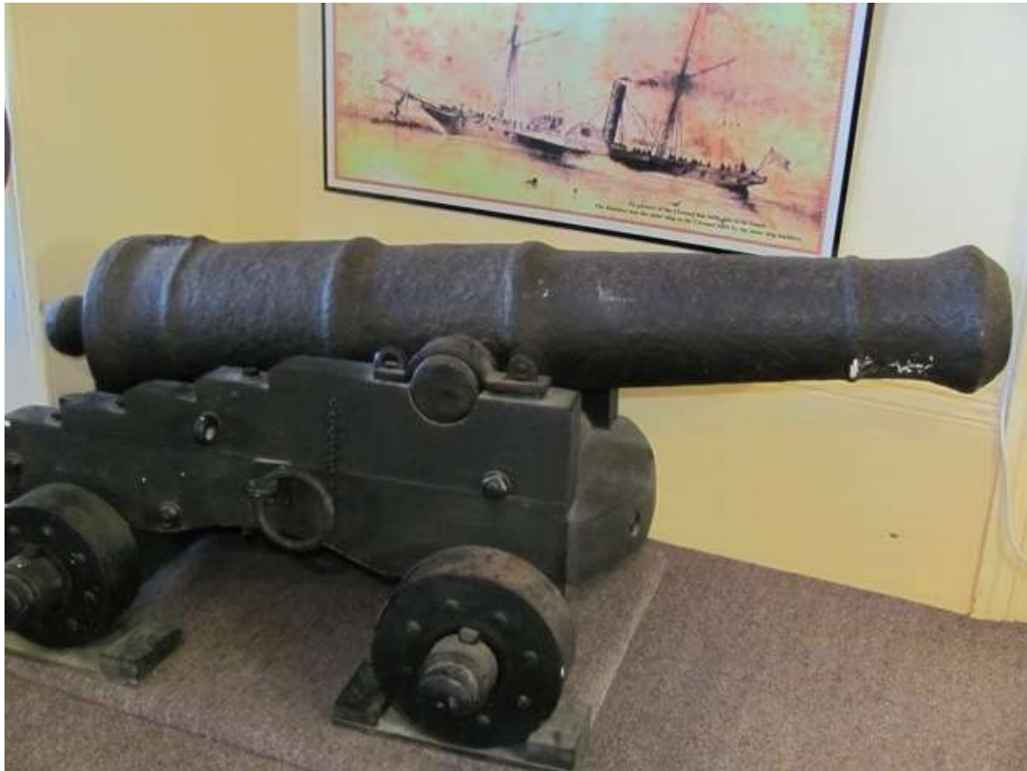
Clonmel Cannon Port Albert Museum

cannon from the wreck of the Clonmel were both held in properties adjacent to Lake Wellington at this time; at Glencoe station (south of present day Sale) and at Strathfieldsaye. The latter was there for protection from attacks by Aborigines but was supposedly either never fired in anger or fired but never loaded with projectiles. It is most likely that the Strathfieldsaye cannon was the one used, implicating Odell Raymond in the massacres. This cannon is held today in the Port Albert Maritime Museum sitting in a new timber carriage.