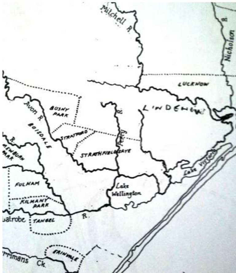
Map 2 Early Squatting Runs (from Meredith Fletcher Avon to the Alps , )

http://www.lawlingpress.com.au/Lakes.html